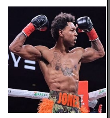
Click Picture to see BoxRec

Division: Super Welterweight Location: Killeen, TX