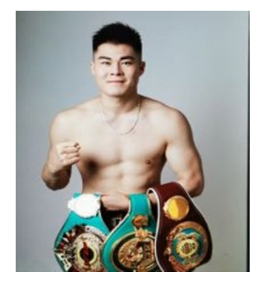
Click Picture to see BoxRec

Division: Featherweight Location: Huntington, WV