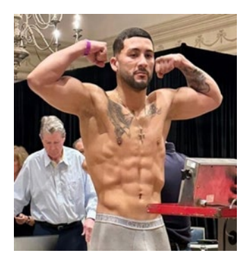
Click Picture to see BoxRec

Division: Bantamweight Location: Merced, CA