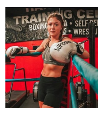
Click Picture to see BoxRec

Division: Super Flyweight Location: San Antonio, TX