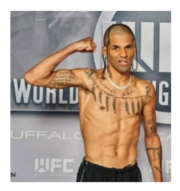
Click Picture to see BoxRec

Division: Super Flyweight Location: Garden City, KS