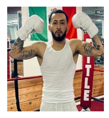
Click Picture to see BoxRec

Division: Super Middleweight Location: Wichita, KS