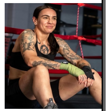
Click Picture to see BoxRec

Weight: 126 Division: Featherweight Location: Memphis, TN