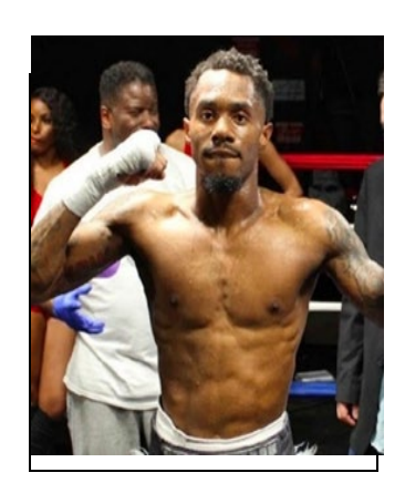
Click Picture to see BoxRec